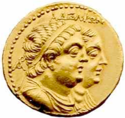
Ptolemy II & his wife